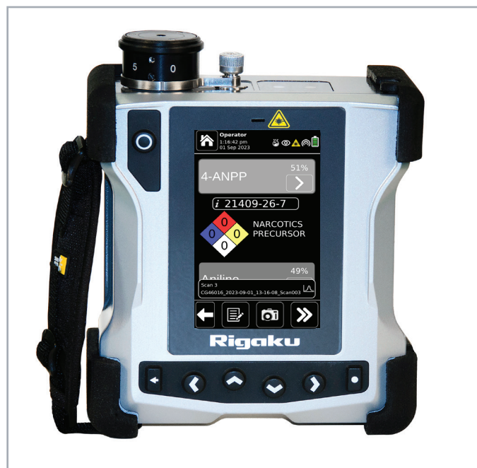
The Rigaku CQL Series of handheld 1064 nm Raman analyzers has the ability to identify fentanyl precursor chemicals, such as 4-ANPP.

The Rigaku Series of handheld 1064 nm Raman spectrometers provide a nondestructive, reliable, and safe method for analyzing and identifying dangerous chemicals, such as fentanyl. More importantly, the identification of mislabeled fentanyl precursors has become a priority for law enforcement and regulatory agencies in their attempts to disrupt the PCSC networks and street-level drug distribution. Rigaku handheld Raman analyzers can scan through translucent packaging, greatly reducing the risk of exposure to the officer.